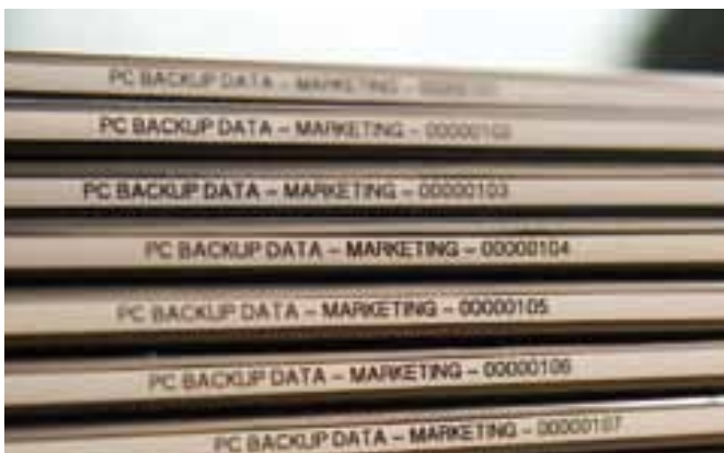
Bring efficiency and organisation through clear identification of your items

Help organise your workplace with clear, high quality, durable labels, office stationery, archive folders, company assets, shelving, parts labelling and custom signage are just some of the many applications. Whether you need one or a hundred labels at a time, a Brother P-touch 9700PC will help ensure your day-to-day work runs as efficiently as you need it to. And with the wide variety of tape widths and colours available you're sure to find one suitable for your needs.