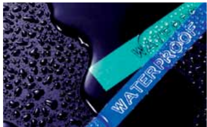
P-touch laminated labels are designed to withstand extreme conditions