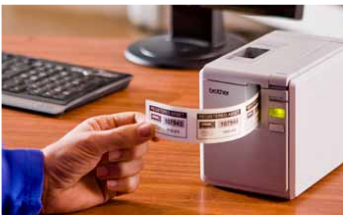
Advanced cutter to keep sequential labels in the correct order

The P-touch 9700PC is based on a durable printing mechanism, and using the specialist HG tape cassettes, boast an impressive print speed of up to 80mm/second, and a print resolution of up to 720 x 360 dpi for perfect image printing. When printing multiple labels, the built-in advanced cutter will keep the labels attached to the backing paper. This ensures that labels are kept in the correct order, and also makes peeling the labels easier from the backing material. Advanced label editing software and a tape cassette are supplied as standard, making both models ready for use straight out of the box.