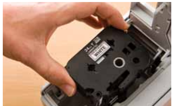
TZ and HG tape cassettes are extremely quick and easy to change